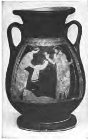
Fig. 2. Rhea offering Cronus the stone in place of Zeus.

After this, Cronus married his sister Rhea and became the father of six children; but since he had been told that a son should overthrow his